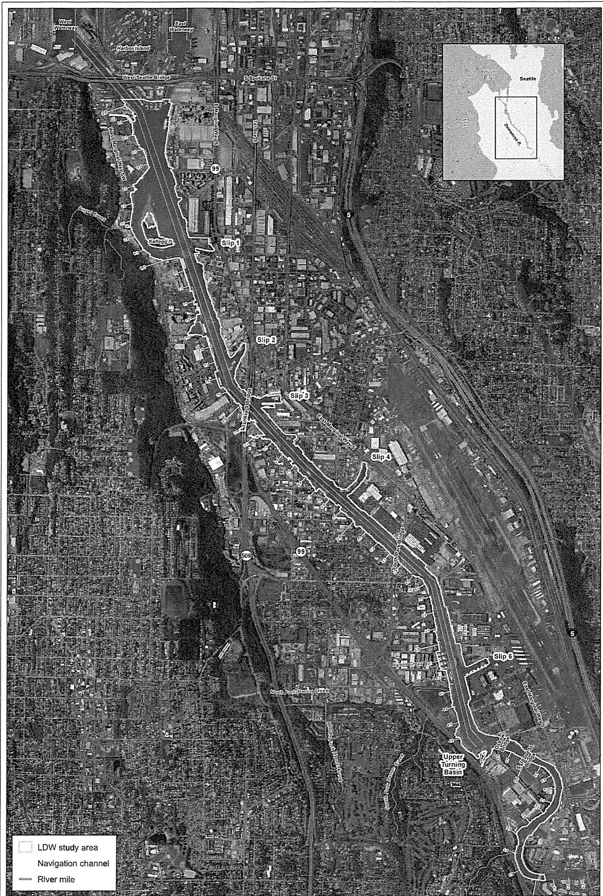
Figure 1. Lower Duwamish Waterway Superfund site

Prepared by: CH2M HILL, 2000, under contract to the U.S. Environmental Protection Agency, Washington, Washington State Department of Ecology, Seattle, Washington